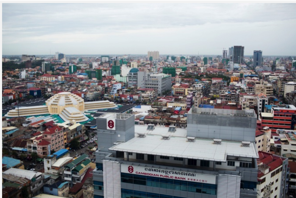
Phnom Penh, the capital and most populous city of Cambodia

📅 MONDAY, NOVEMBER 21, 2016 - 1 HOUR AGO | 💬 NO COMMENTS | 👁️ 295 VIEWS