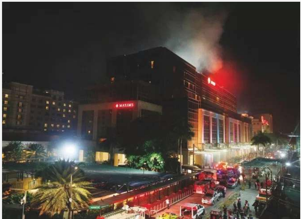
Smoke billowing from the Resorts World complex in Pasay City where the arson attack in June took place

TUESDAY, AUGUST 22, 2017 - 2 DAYS AGO NO COMMENTS 1,184 VIEWS