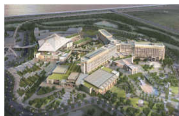
Paradise City – Preview

resurgence of smaller junket operators August 7, 2017